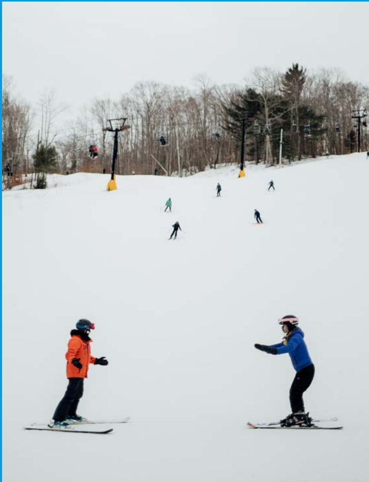
- Teaching Lessons -