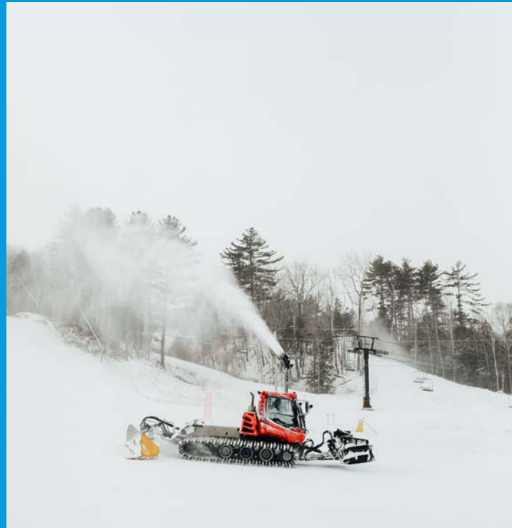
- Grooming Snow -